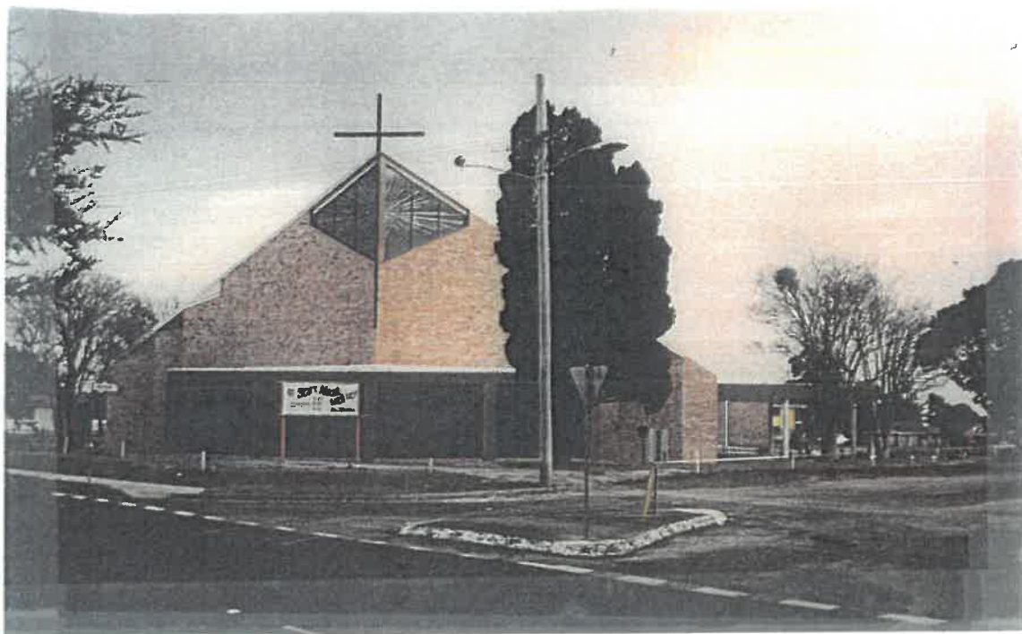
Opening and Dedication of Redcliffe Uniting Church 6 th May 1990